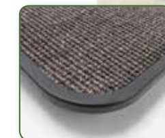
Boot tray with sisal rug remnant

Click-together garage floor tiles are another great alternative. Available in a variety of colors and patterns, these plastic tiles attach to cover any size area. They have an open texture, allowing loose litter to fall through the holes, trapping it below. Simply pick up the tiles and vacuum or sweep underneath periodically.