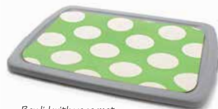
Box lid with yoga mat

There are lots of options for creating your own custom litter mat. Experiment with materials and designs until you find something that works for both you and your cat.