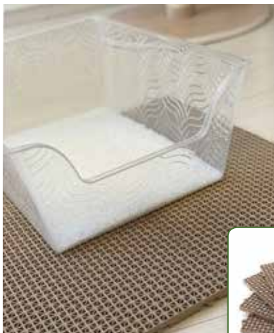
Garage floor tiles

Use a dormat or a bath mat . These options come in every color and style with textures that easily trap litter, and most are easy to clean either in the washing machine or with a hose.