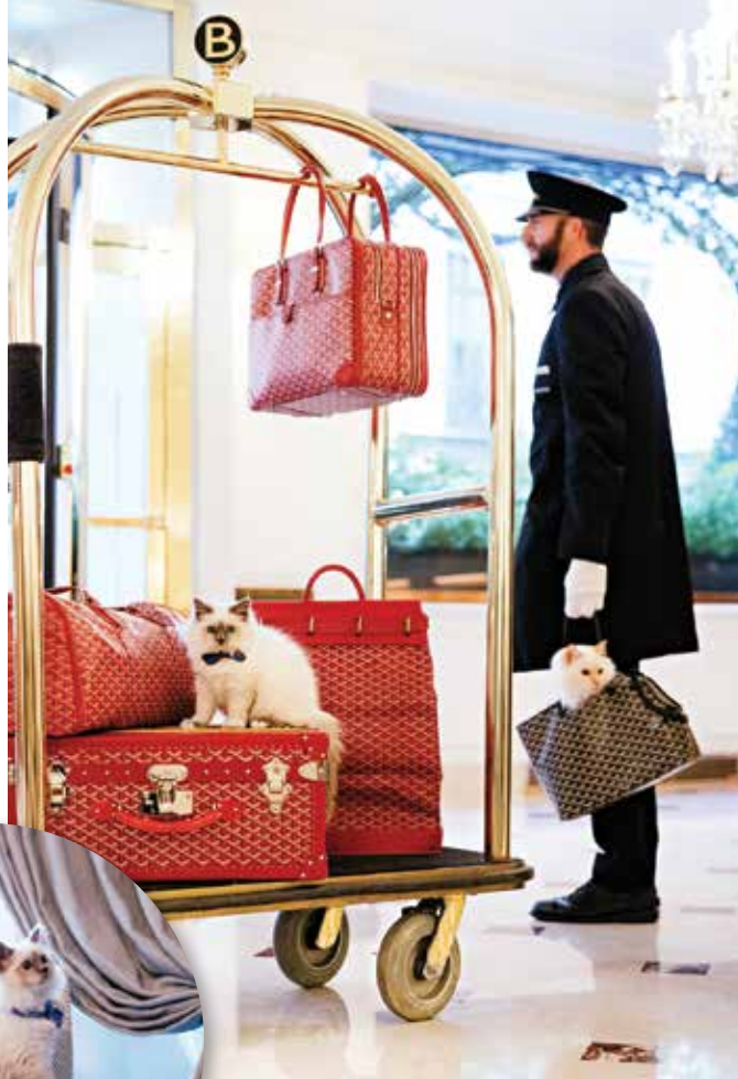
The job of resident cat of Le Bristol hotel in Paris is now in the capable paws of Socrate, who enjoys lounging around the lobby.