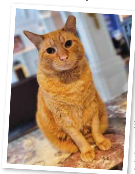
Hamlet is the eighth Hamlet (following three Matildas). All were named after famed resident John Barrymore, in honor of his greatest stage role.

A relatively recent addition to the scene, Lilibet is an illustrious Siberian kitty who decided on a whim to call The Lanesborough in London her new home back in 2019. Taking advantage of her salubrious situation, Lilibet spent this year's