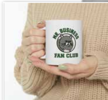
Mr. Business Fan Club Mug $9.26. FarnumInkStudio at etsy.com