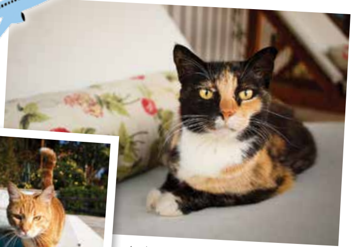
At the Ionia Guest House in Turkey, Leo (left) likes to prowl the grounds, while Pringles (above) enjoys lounging on the sun porch.

International Cat Day scarfing down a particularly fancy-looking tuna tartare delight from a lavish porcelain plate.