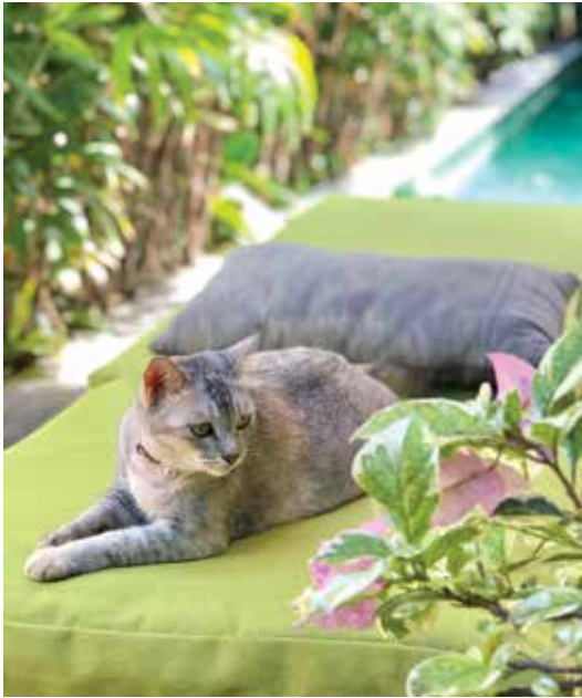
Now that her kitten-rearing days are over, Mama Cat enjoys relaxing poolside at the Kembali Guest House in Bali.