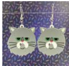
Mr. Business Dangle Earrings $18. ShopHelloDisco at etsy.com