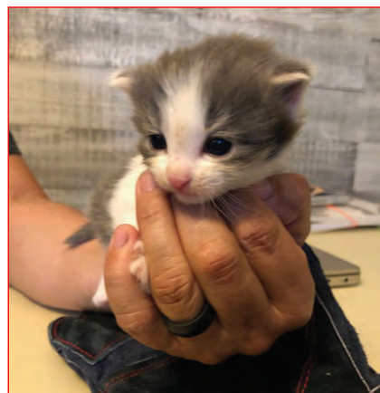
One of six from a six-month-old mother

Recently a tame kitten was given to a family in a Santa Maria apartment complex. They did not allow the kitten into their apartment nor did they feed it regularly. She began to roam throughout the neighborhood, looking for food. One of our volunteers noticed the kitten was hungry and neglected and