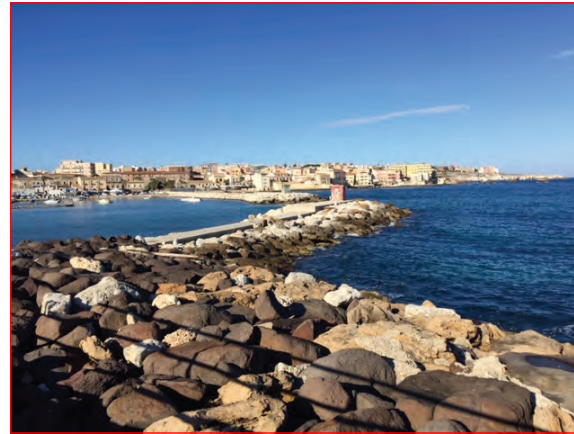
Club Med for Cats? Ortigia, the historic heart of the city of Syracuse, lies just off the Mediterranean coast in Sicily. Among its many charms are an abundance of well-cared-for, semi-feral outdoor cats.